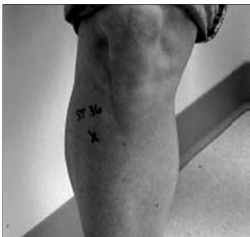
Figure 1: ST36 (Joksamly)

On the second day of chemotherapy, patients in the experimental group received 3 min finger acupressure on point ST36, a point traditionally used for “energy,” [14] located below the knee in the anterior border of tibia. The control group instead received pressure on a point not associated with “energy” in TCM, i.e. LI12 located on the lateral side of the upper arm, with the elbow flexed, on the tile border of humerus [Figure 2]. [15] Patients in both acupressure groups were told that the effects of two sets of points were tested, but they were not aware that one set was a sham technique.