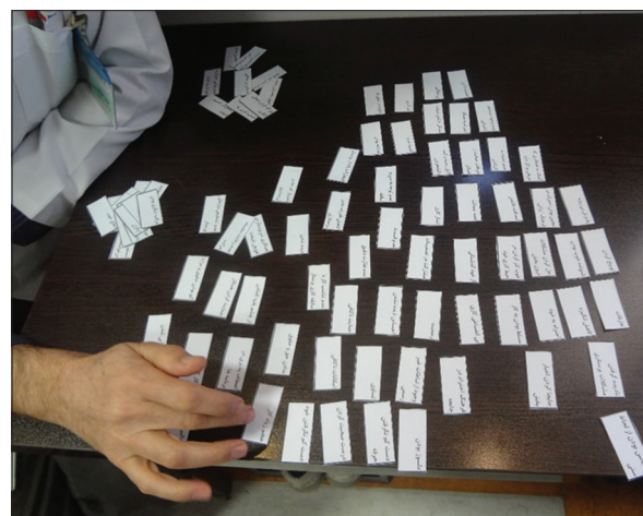
Figure 2: Card sorting technique for verification of the data by the informants