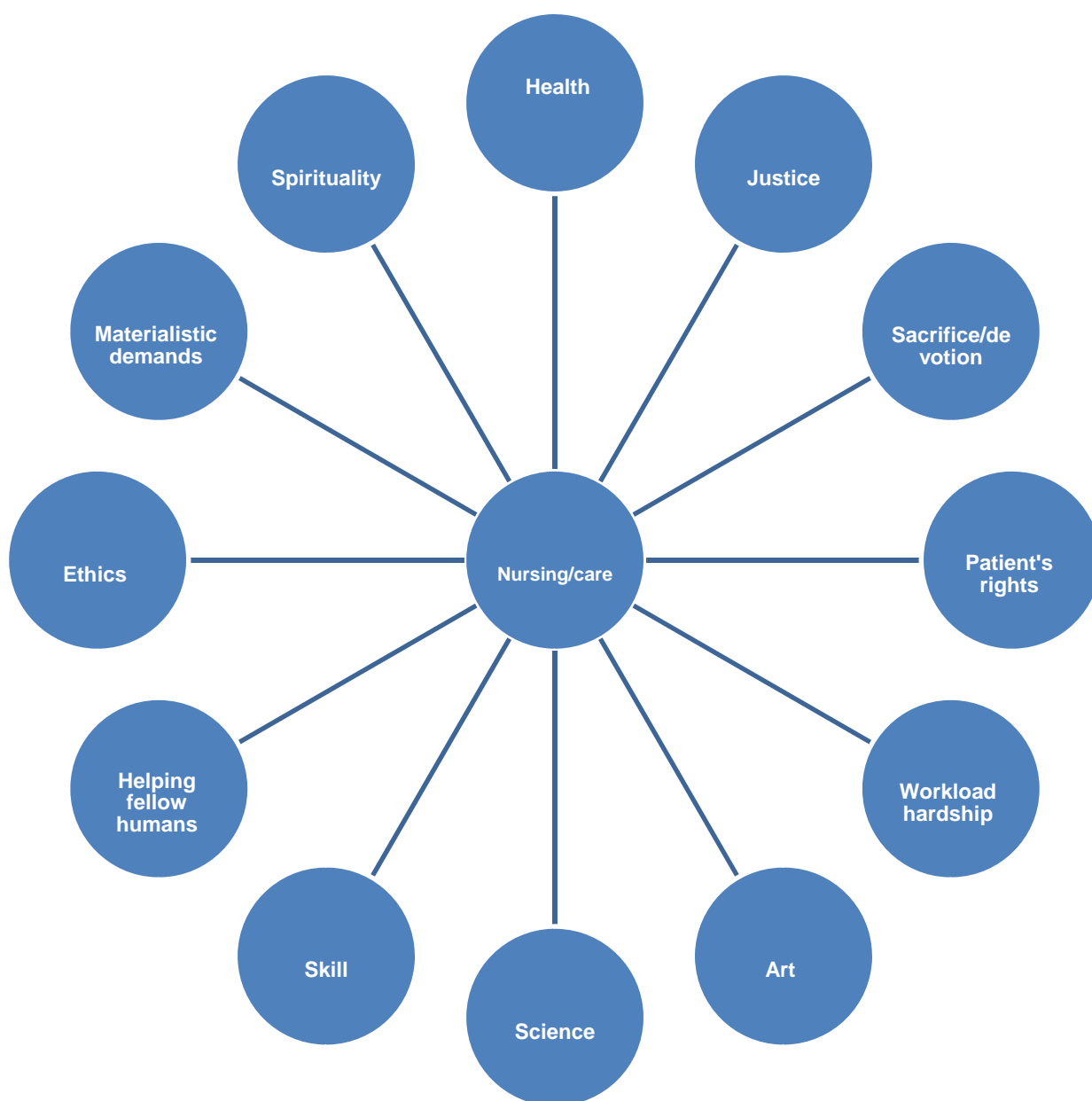
Figure 2. Semantic system and key signs of nursing discourse in interviews